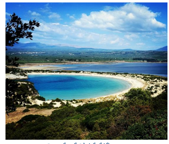
Beach of Voidokilia

Beach Hotel Karalies <u>www.karaliesbeach.gr</u> Yoga daily, Airport Transfer and all ground transportation for Day trips to World Class Beaches, Ancient Olympia, Castles, Ancient Messini, Shopping in Kalamata, Olive Groves and plenty of time to Relax and Restore To Reserve; $500 due by October 1, 2016